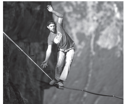
Perfect love casts out fear